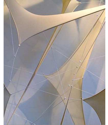
Preview on PULSAR